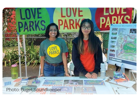
The Duwamish River Festival brought community together to Unite for Justice in South Park with information booths about climate and neighborhood initiatives, free food, music and more.